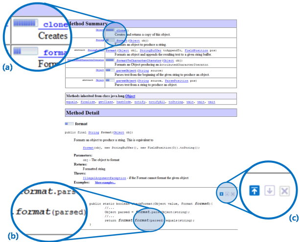
Figure 2: An example page of generated eXoaDocs. (a) The popularity information of methods (b) Code examples (c) User’s feedback button

Figure 2 (a), to help developers’ browsing needs to find APIs that are used frequently in programming tasks. For each API, two to five code examples are presented, as Figure 2(b) shows. From this point on, we call these documents example oriented API Documents (eXoaDocs) .