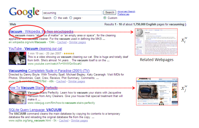
Figure 2. Extract Web data for activities.

In practice, as the activity names are known, we can employ Web search to extract web pages related to the activities. For example, for an activity "Vacuuming" defined in the taxonomy of Figure 1, we can search on Google with the query "Vacuuming" as shown in Figure 2. Then we can get a list of search results on the page. By clicking all search results, we can get a set of Web pages. Although the Web pages contain a lot of information, only a small amount of it is related