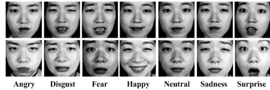
Fig. 4. Some sample images from the JAFFE database