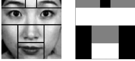
Fig. 3. (a) An example of facial expression image divided into eight regions; (b) The weights set for different regions: black regions indicate weight 1.00, gray regions 2.00, and white regions 4.00.

where q is a continuous parameter, m denotes the maximum number of histogram bins, and h_j is the value of histogram entry i . The physical meaning of Tsallis entropy [8] is that it reflects the distribution characteristics of a histogram. Therefore, it can capture more detailed information with respect to the histogram distribution than the average magnitude response (i.e., mean value of the histogram) which was adopted by most traditional methods.